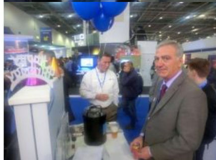
Thursday 15 March 2012 Open publication