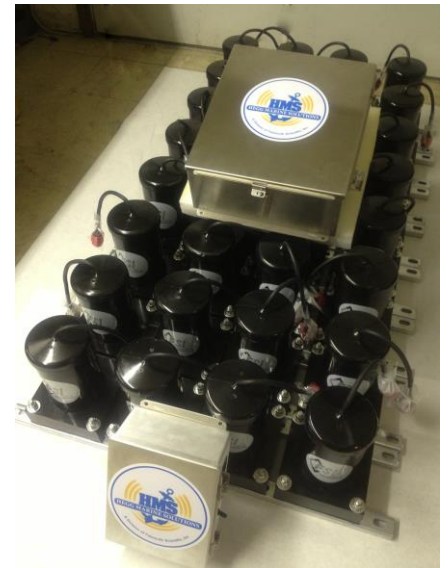
HMS-ATT45K transducers shown in a 4x8 sub-bottom profiler array