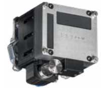
Sonic 2020-V with optional mount